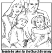
Soon to be taken for the Church Directory

We will be doing a new Photo Directory January 29-31, 2009!