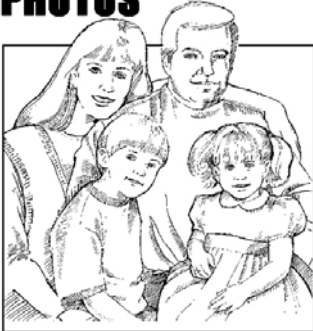
Soon to be taken for the Church Directory